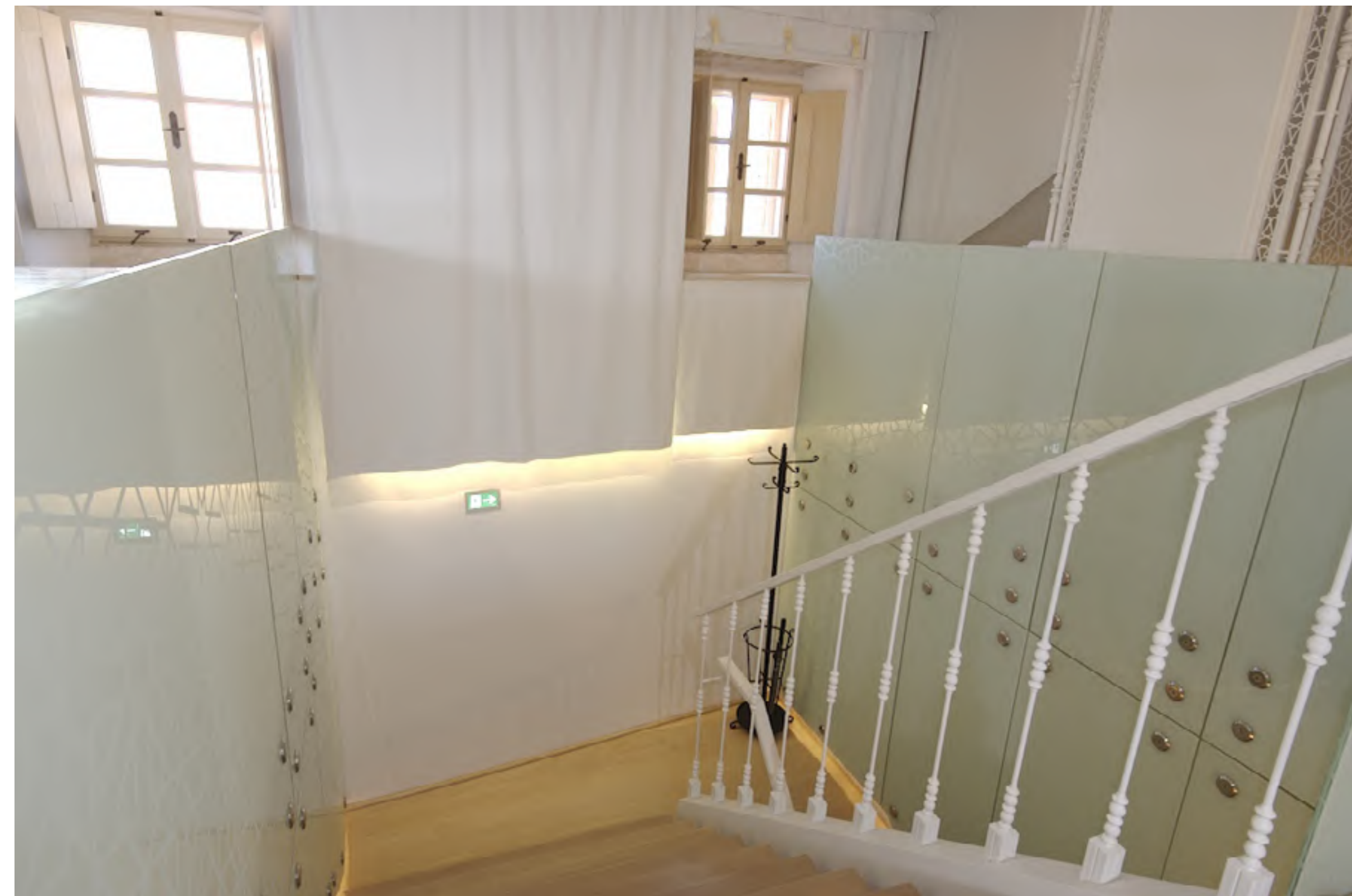
Stairs leading to the residence Arabia