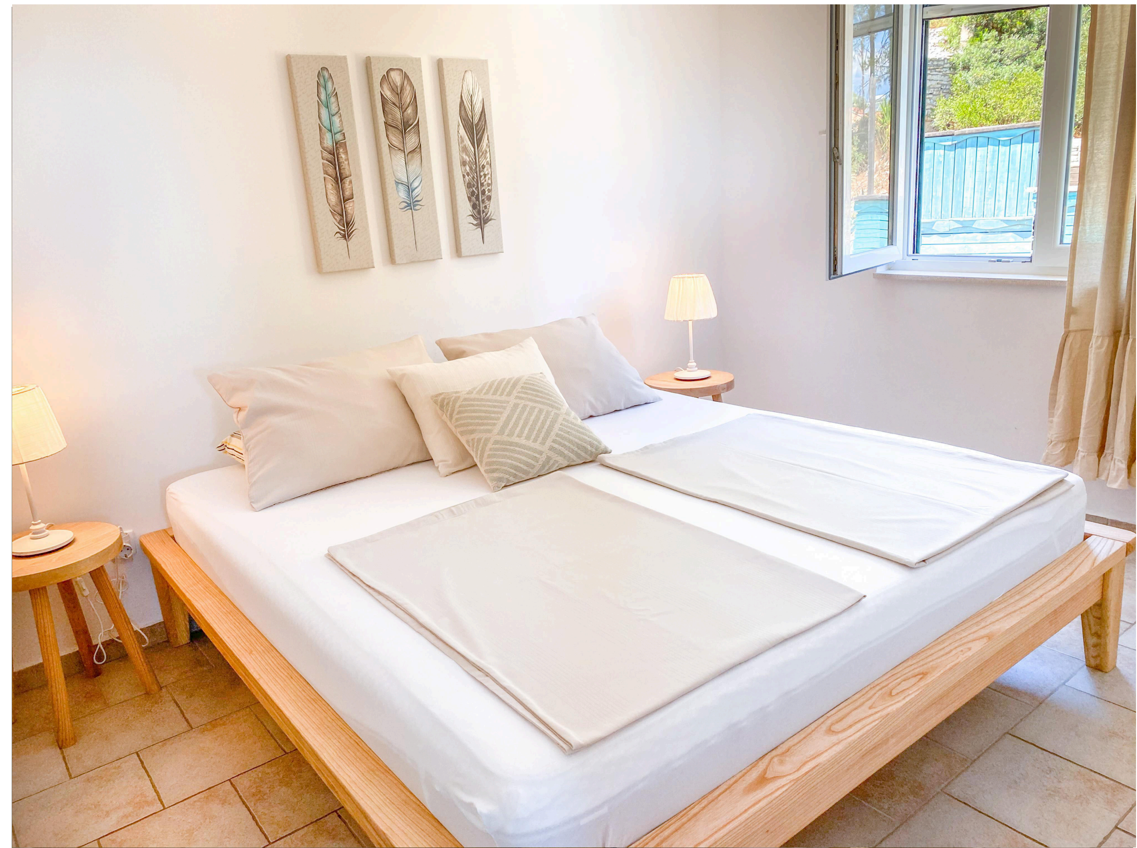
Comfortable bedroom with mosquito net on the window and enough space for a baby cot and suitcases